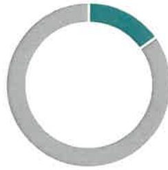
■ Low-risk suppliers ■ Medium-risk suppliers

As per the "Raw Materials Intake by Continent" for the period between January 1 st 2023, and December 31 st , 2023, the data is as follows: