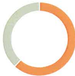
■ CAHRAs ■ Non-CAHRAs

As demonstrated above, Thaisarco sourced raw materials from Conflict-Affected and High-Risk Areas in 2023, with approximately 62% originating from regions with red flags and 38% from non-Conflict-Affected and High-Risk Areas within the supply chain.