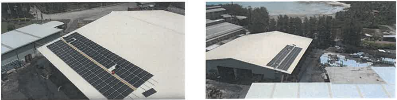
Fig 1: Installation of Solar roof cells at the Factory

Furthermore, Thaisarco is actively participating in the CO 2 Compensation program through the Shell Company of Thailand, demonstrating its dedication to environmental sustainability and responsible business practices.