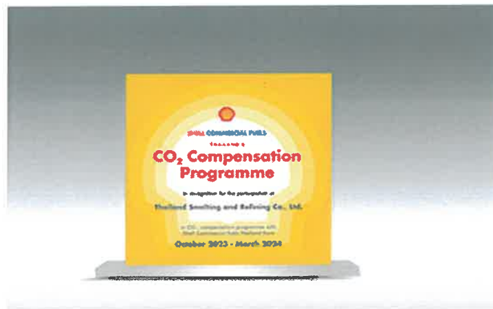
Fig 2: Certificate acknowledging involvement in the Shell CO 2 Compensation Programme