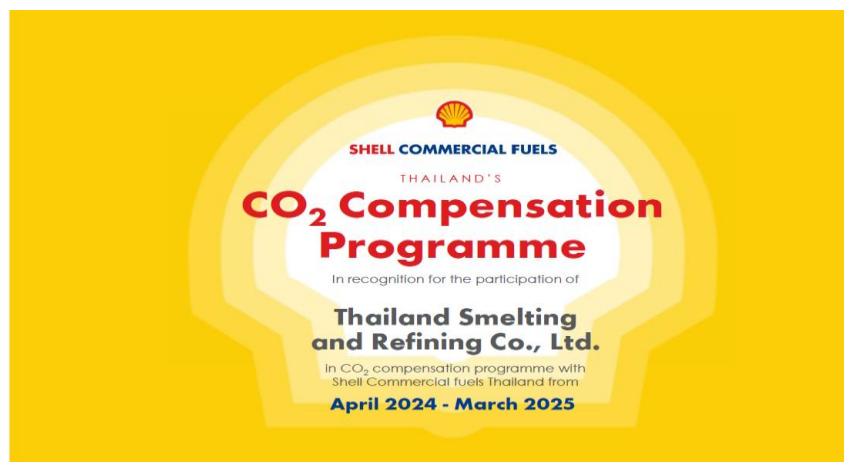
Fig 1: Certificate acknowledging involvement in the Shell CO 2 Compensation Programme

In addition to environmental initiatives, Thaisarco allocates annual funding to support local ESG programs, including corporate social responsibility (CSR) activities, educational scholarships for surrounding communities, and other initiatives aimed at promoting sustainable social and economic development.