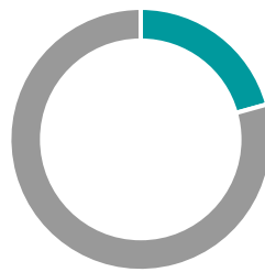
■ Low-risk suppliers ■ Medium-risk suppliers

As per the "Raw Materials Intake by Continent" for the period between January 1, 2025, and December 31 st , 2025, the data is as follows: